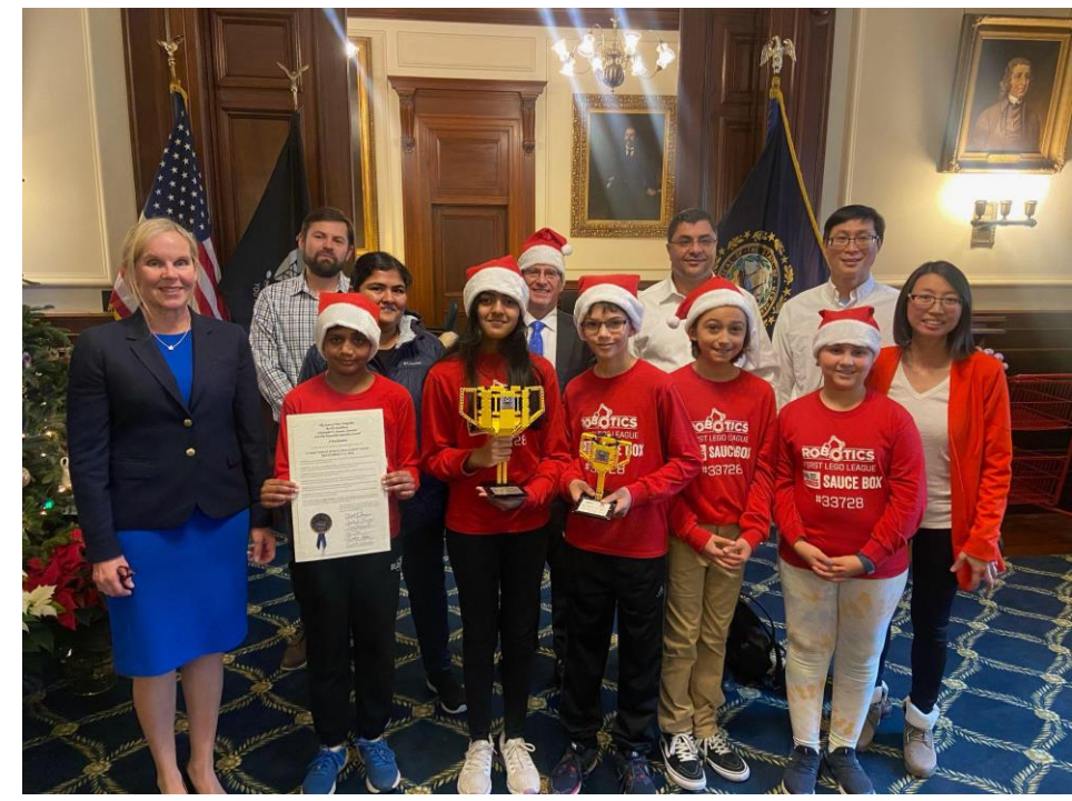
New Hampshire Lego Robotics Champions- Windham